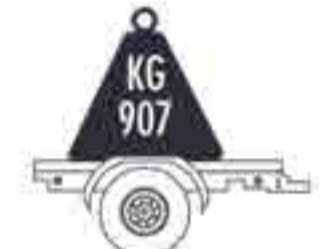
907KG TOWING CAPACITY