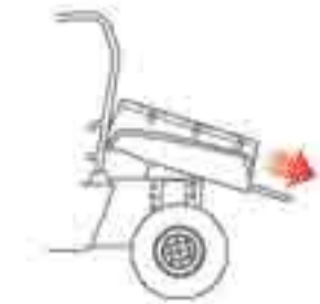
DUMP BOX CAPACITY - 567KG