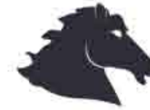
760CC - 40HP