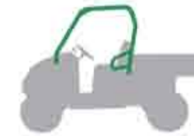
ROLL OVER PROTECTION STRUCTURE