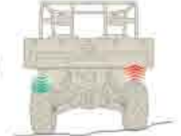
SIX WHEEL INDEPENDENT SUSPENSION